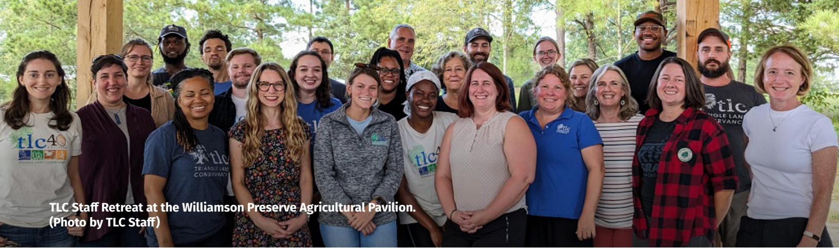
TLC Staff Retreat at the Williamson Preserve Agricultural Pavilion.

Significantly, Sandy has led TLC through the 2018 strategic planning process, and followed through on all four of its mission statement goals while doubling the pace of land conservation in the Triangle: