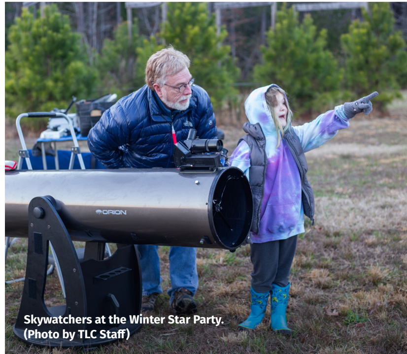
Skywatchers at the Winter Star Party.

We engaged 2,684 people while collaborating with 95 unique community partners throughout the year.