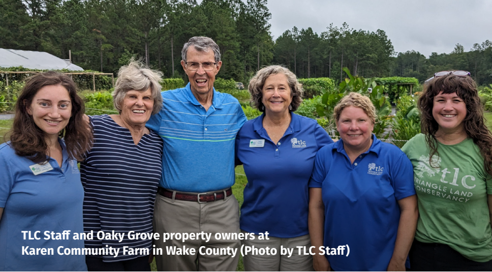
TLC Staff and Oaky Grove property owners at Karen Community Farm in Wake County