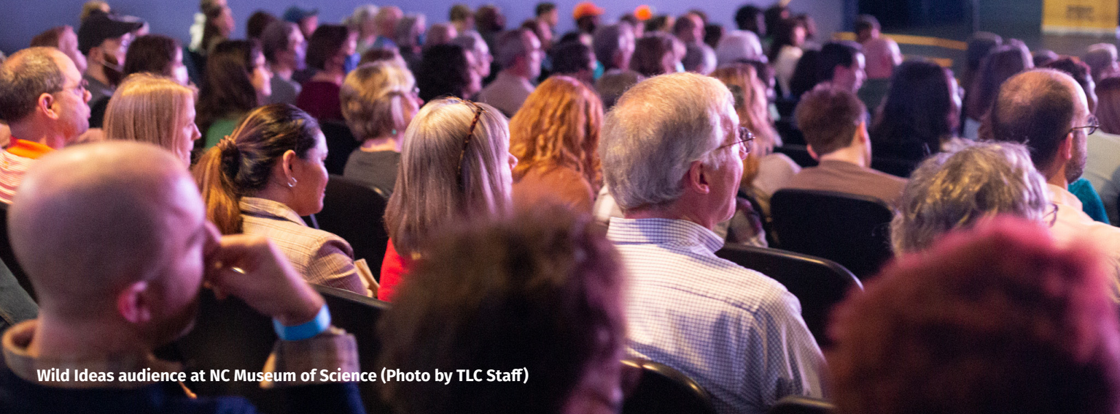
Wild Ideas audience at NC Museum of Science