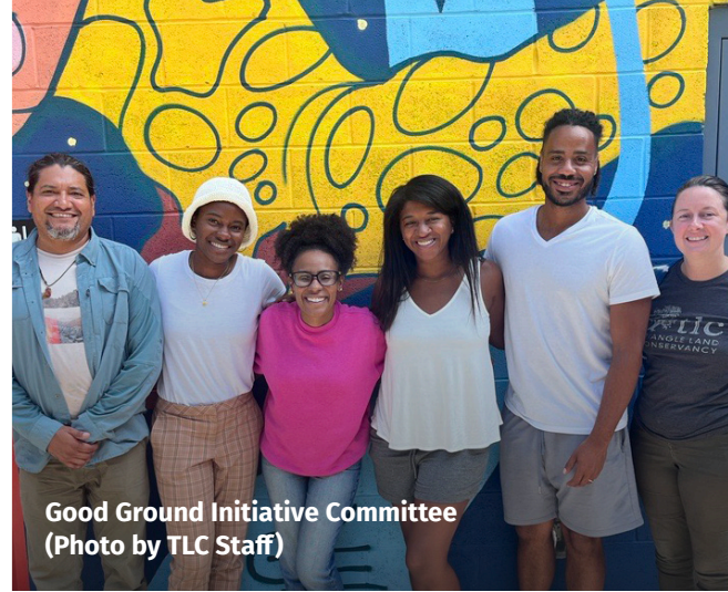
Good Ground Initiative Committee