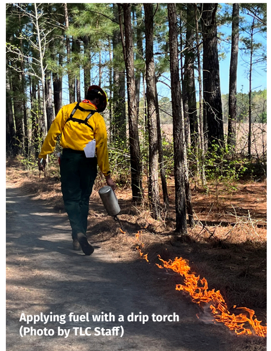
Applying fuel with a drip torch