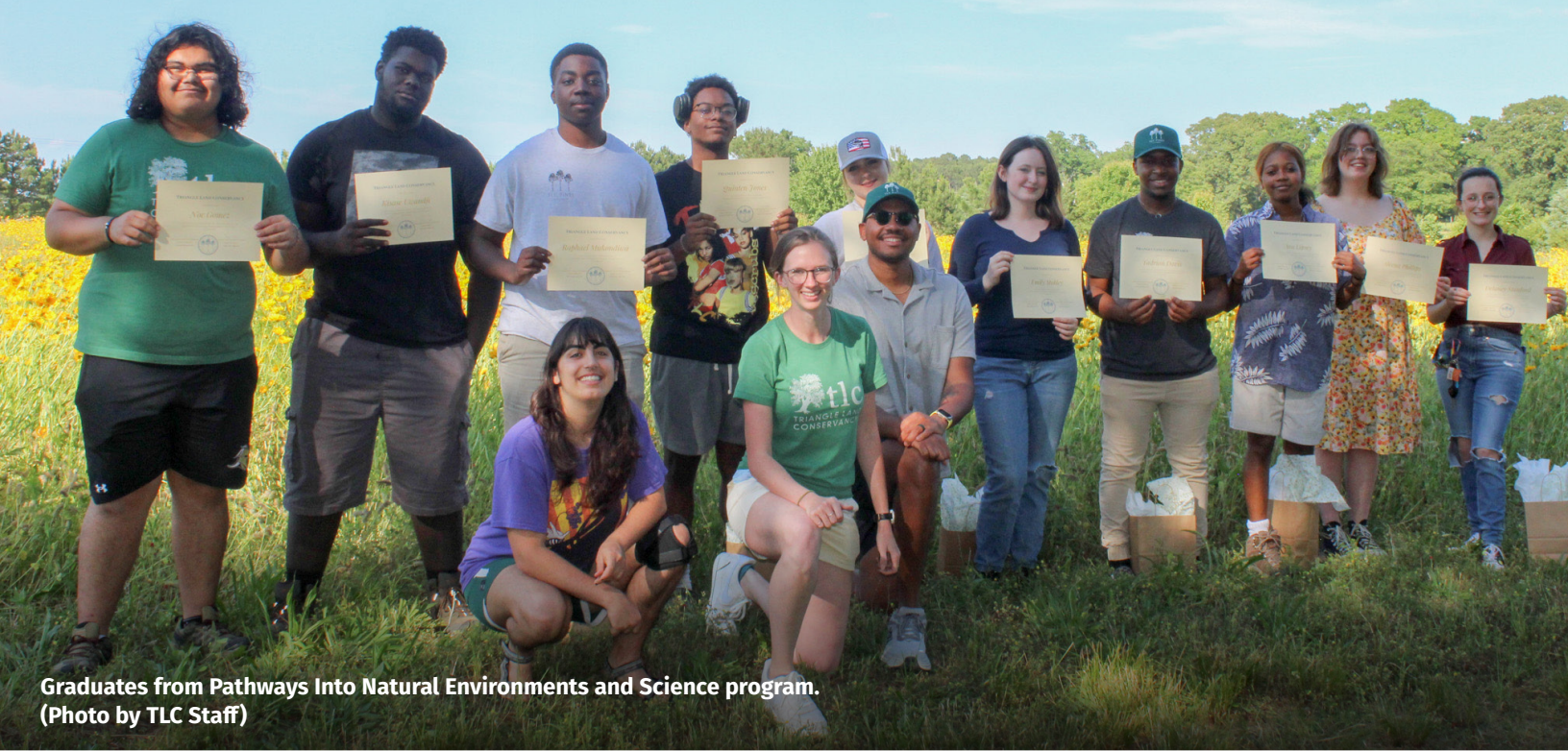
Graduates from Pathways Into Natural Environments and Science program.