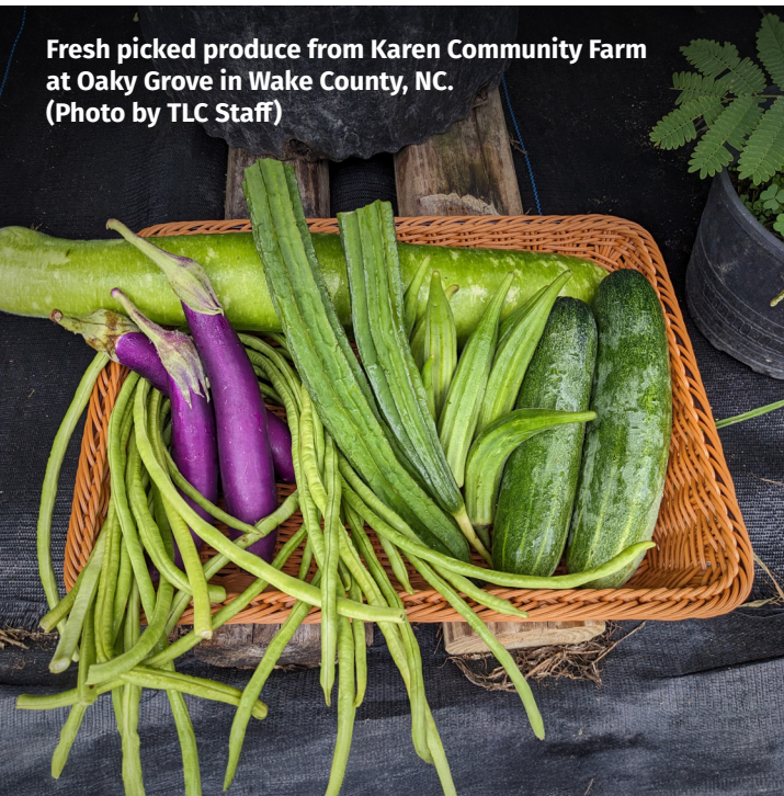
Fresh picked produce from Karen Community Farm at Oaky Grove in Wake County, NC.

352 volunteers assisted TLC with teaching programs, administrative tasks, leading hikes, maintaining trails, and monitoring easements. As the number of easements held by TLC has increased, we have expanded our stewardship staff and trained volunteers to assist with monitoring. In FY23, volunteers contributed 250 hours to monitor 46 of TLCs easements.