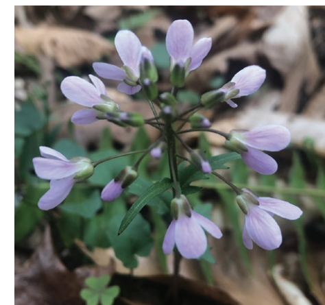
Douglass's Bittercress ( Cardamine douglassii), a rare plant found in the Hurricanes region.