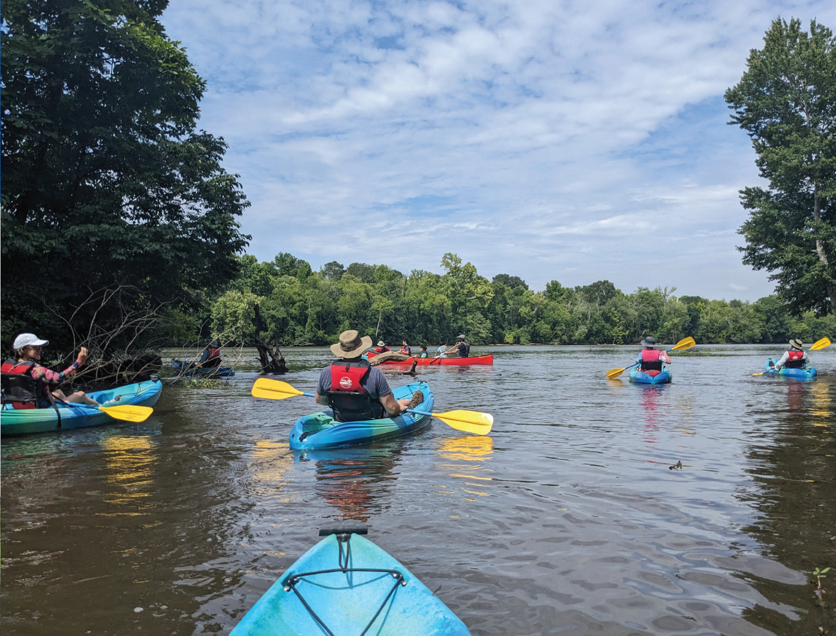
River Society members enjoyed a guided paddle at the Cape Fear Bottomlands where TLC has protected 665 acres.