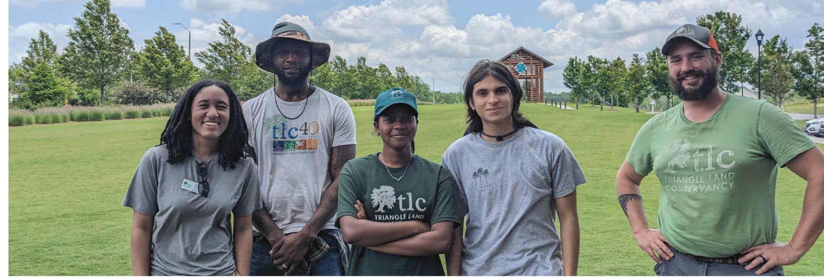
TLC staff members with 2024 Summer Stewardship Interns