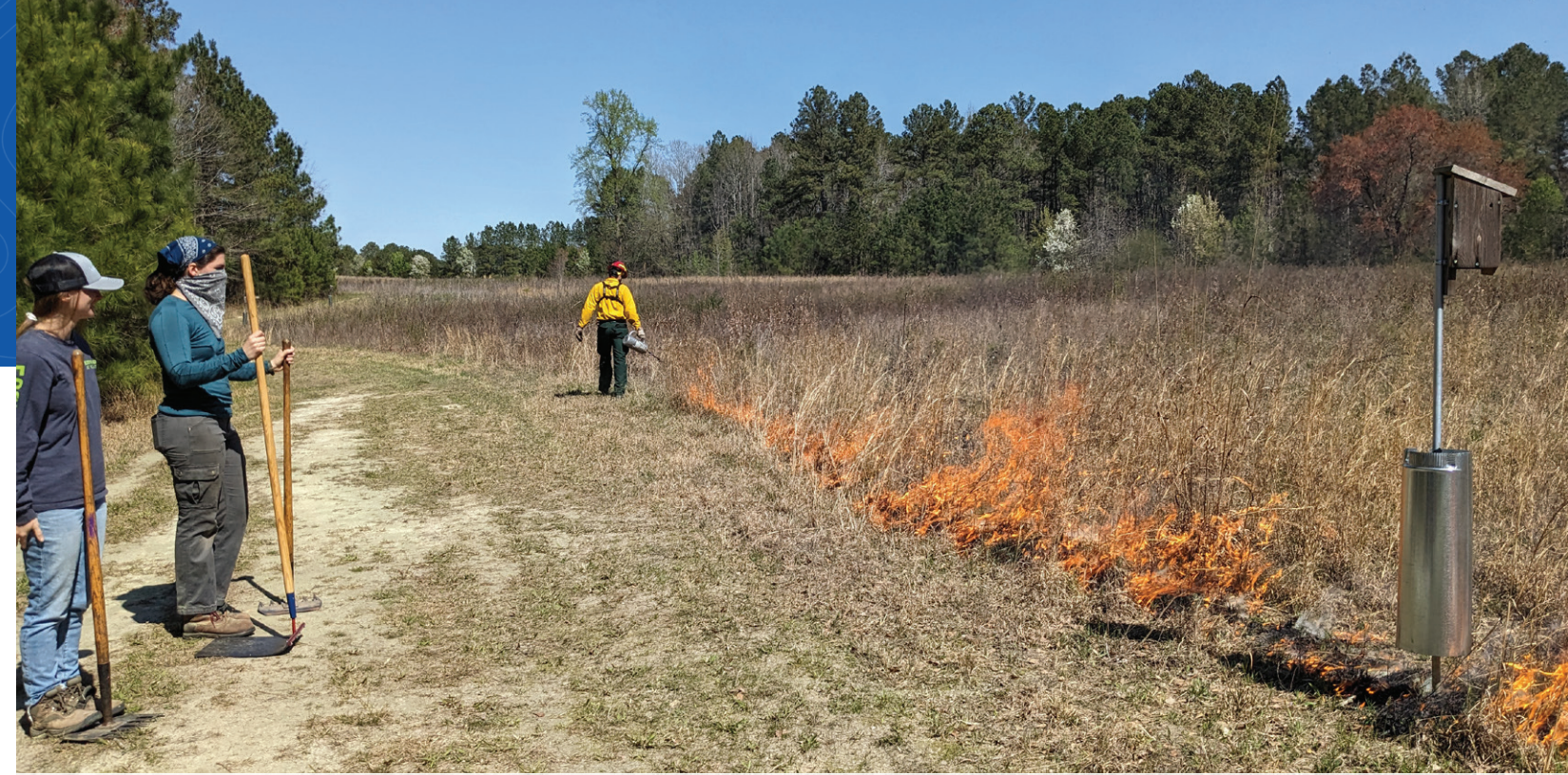
TLC staff demonstrated prescribed burn technique with volunteers from Leaf and Limb at Williamson Preserve.