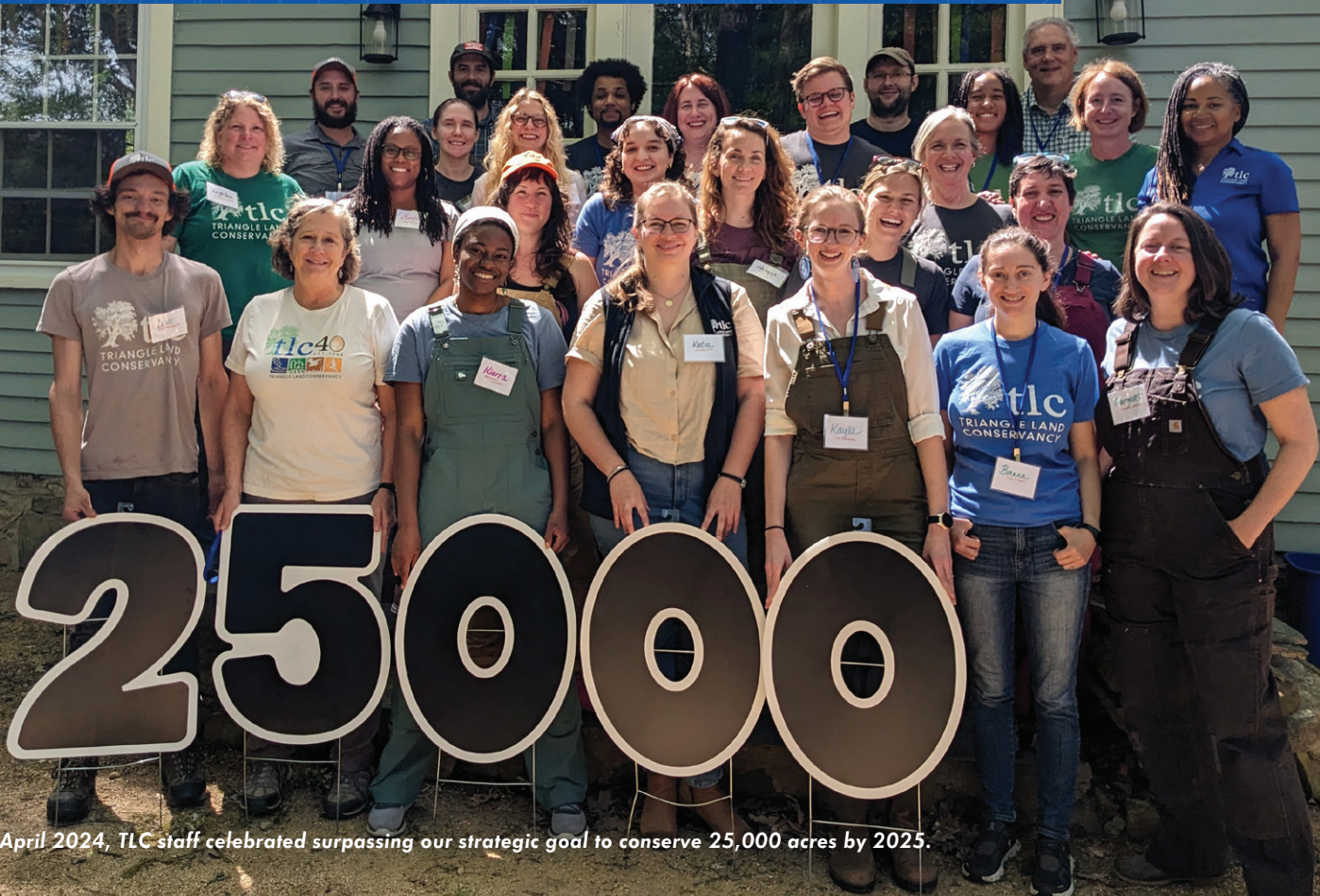
In April 2024, TLC staff celebrated surpassing our strategic goal to conserve 25,000 acres by 2025.

Surpassing our goal to conserve 25,000 acres by 2025, we hope you will continue to support our efforts to accelerate the pace of conservation by being a force for nature!