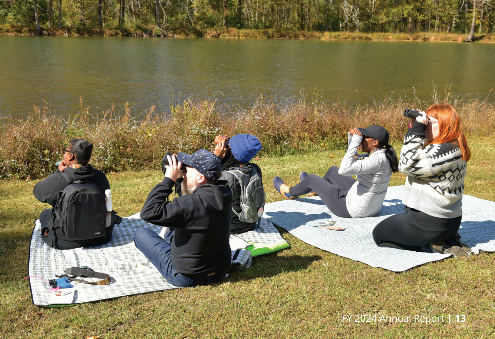
Birdwatchers and their binoculars at Fall 2023 Wild I.D.E.A.s Gets Outside