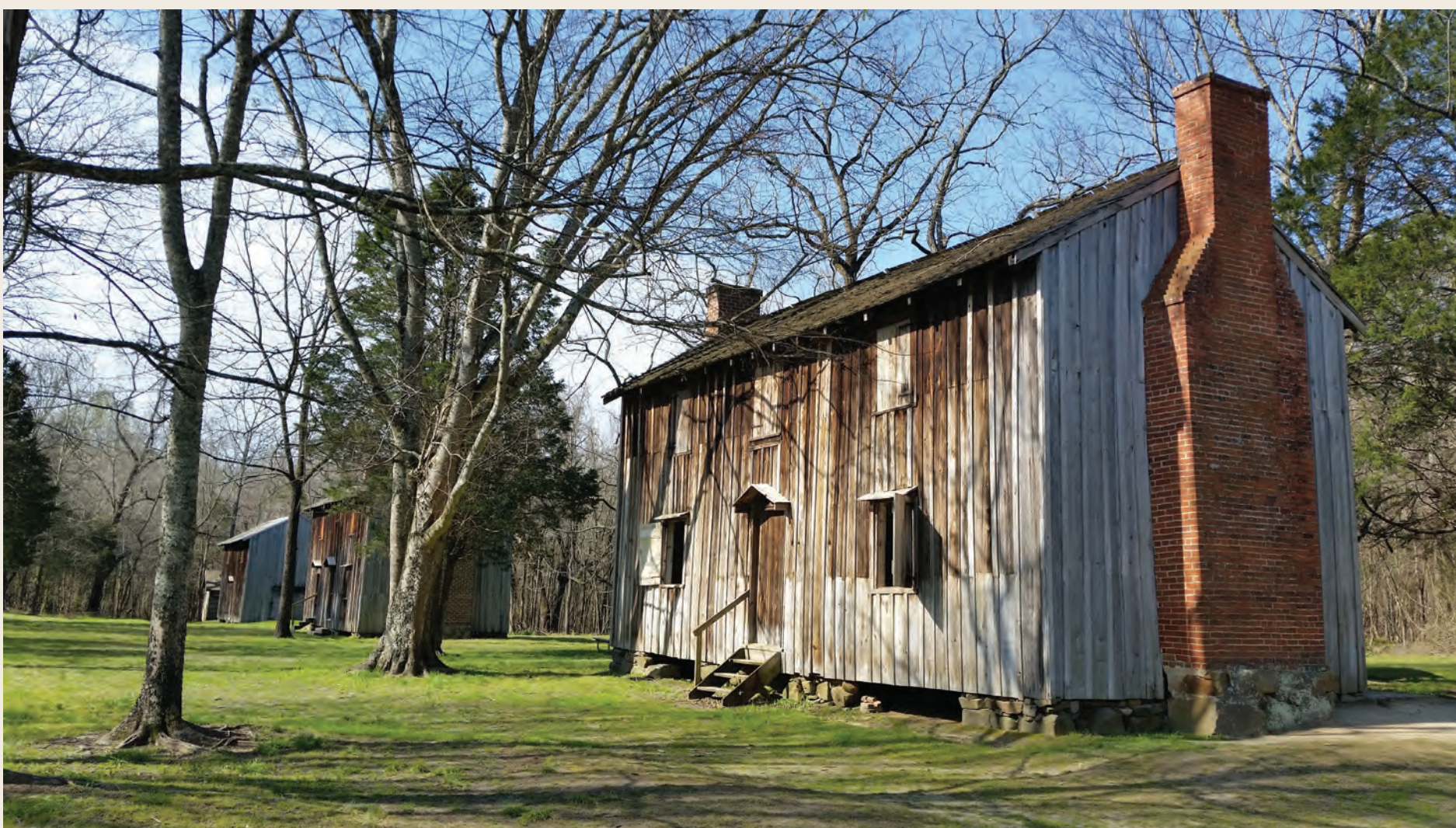
Original 1851 slave dwellings at Horton Grove

The land of the Horton Grove Nature Preserve used to be part of one of the largest plantations in North Carolina, owned by the Bennehan and Cameron families. Today, this plantation is known as Stagville. Hundreds of enslaved people were forced to work here to produce grains, textiles, tobacco, timber, bricks, and more. Each of the Horton Grove trails is named for a local African American family whose ancestors endured slavery at Stagville. Their stories illuminate enslaved families' resilience, and their persistent struggle for freedom.